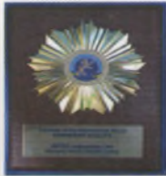
EUROPEAN QUALITY AWARD AND CERTIFICATE