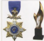
EUROPEAN BUSINESS ASSEMBLY BEST ENTERPRISE 2013 AWARD