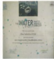
WATER DIGEST AWARD AND CERTIFICATE 2008-09, 2009-10