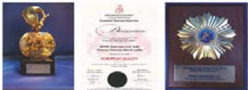
EUROPEAN QUALITY AWARD AND CERTIFICATE