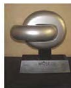
WATER DIGEST AWARD AND CERTIFICATE 2008-09, 2009-10