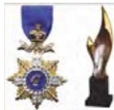
EUROPEAN BUSINESS ASSEMBLY BEST ENTERPRISE 2013 AWARD